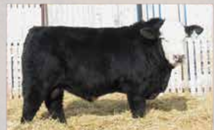
FAIRVIEW GODFATHER 648M SIRE: MRL SYSCO 14D HOMO POLLED HETERO BLACK

Polled Fleckvieh, Red & Black Replacement Heifers for sale by Private Treaty