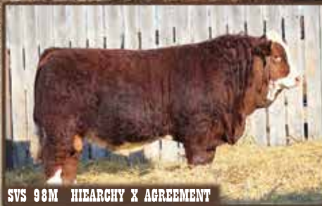
SVS 98M HIEARCHY X AGREEMENT