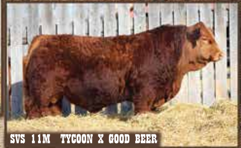
SVS 11M TYCOON X GOOD BEER