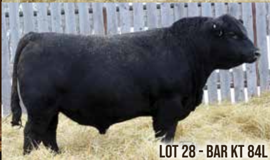
LOT 28 - BAR KT 84L