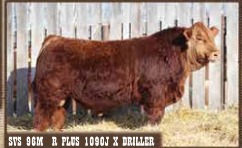
SVS 96M R PLUS 1090J X DRILLER