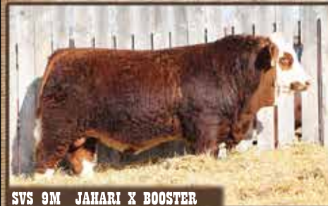
SVS 9M JAHARI X BOOSTER