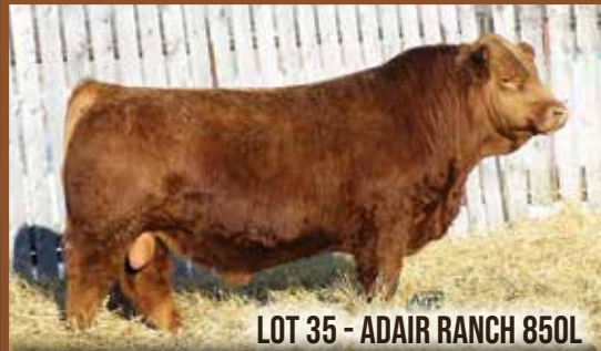
LOT 35 - ADAIR RANCH 850L