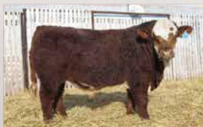
FAIRVIEW ENFORCER 137M SIRE: FAIRVIEW PHILOSOPHY 99E HOMO POLLED 100% FLECKVIEH NON-DILUTOR