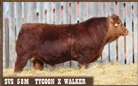
SVS 58M TYCOON X WALKER