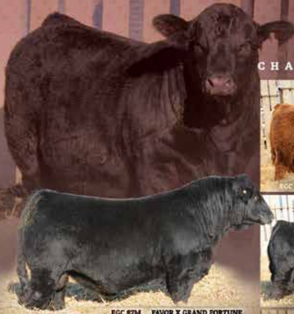
EGC 87M FAVOR X GRAND FORTUNE