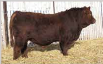
FAIRVIEW BOSS 348M SIRE: MRL SYSCO 14D HOMO POLLED NON-DILUTOR