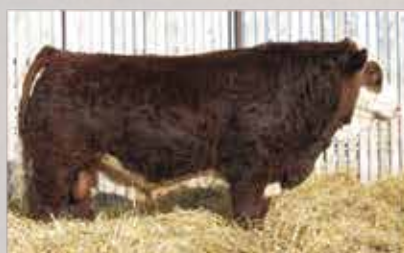
FAIRVIEW OZZY 117M SIRE: VIRGINIA SPRINGSTEEN 66K HOMO POLLED FULL FLECKVIEH NON-DILUTOR