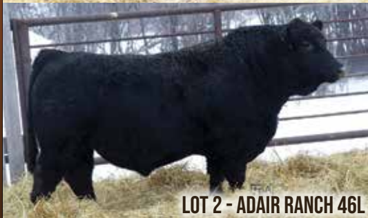
LOT 2 - ADAIR RANCH 46L