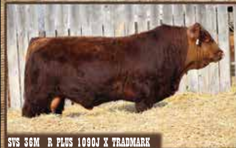
SVS 36M R PLUS 1090J X TRADEMARK