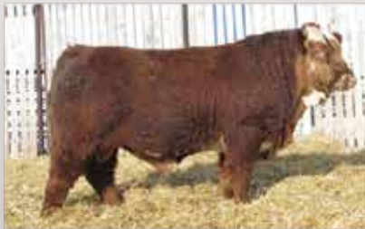
FAIRVIEW DIESEL 718M SIRE: SIBELLE POL DARWIN 21F HETERO POLLED 100% FLECKVIEH NON-DILUTOR