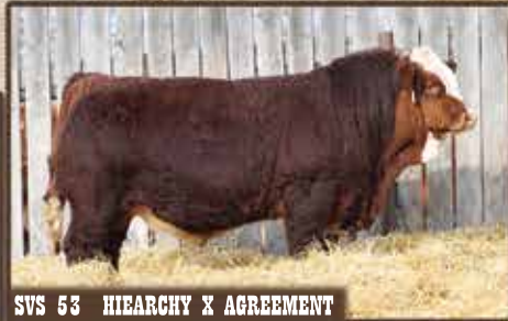
SVS 53 HIEARCHY X AGREEMENT