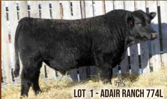
LOT 1 - ADAIR RANCH 774L