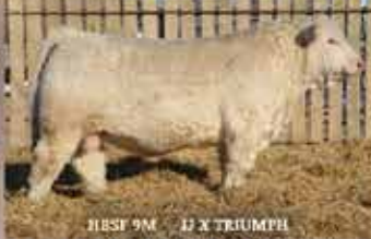
HBSF 9M JJ X TRIUMPH