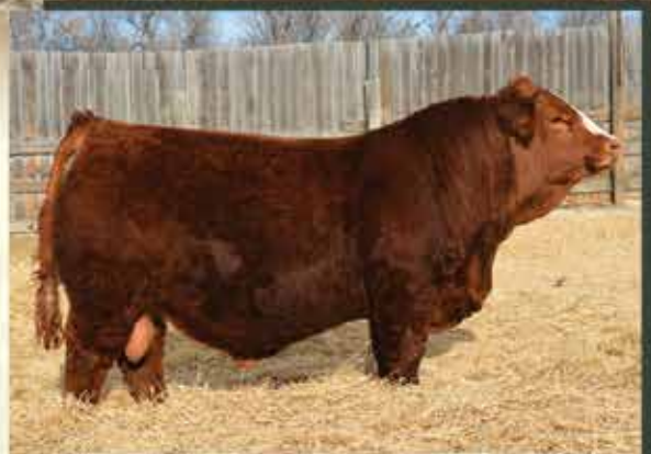
BOUNDARY LOYALTY 70M