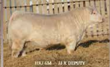
HBJ 6M JJ X DEPUTY