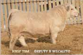
HBSF 73M DEPUTY X MESCALITO

42 CHAROLAIS BULLS 23 SIMMENTAL BULLS 6 ANGUS BULLS 34 SIMMENTAL & CHAROLAIS PUREBRED HEIFERS