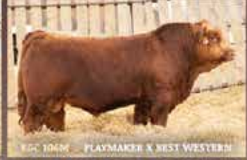
EGC 106M PLAYMAKER X BEST WESTERN