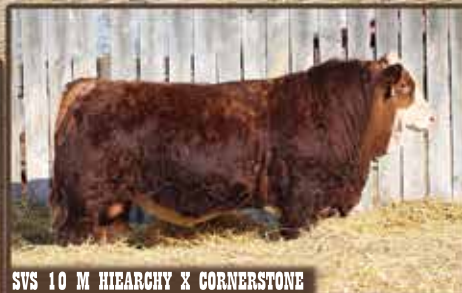
SVS 10 M HIEARCHY X CORNERSTONE