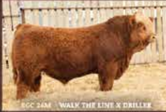
EGC 24M WALK THE LINE X DRILLER