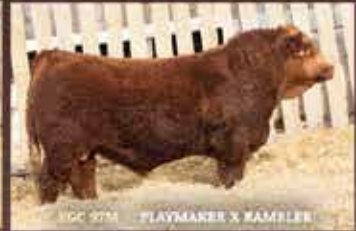
EGC 37M PLAYMAKER X RAMBLER