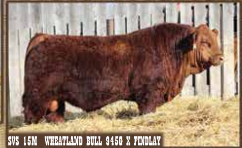
SVS 15M WHEATLAND BULL 945G X FINDLAY