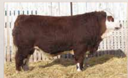
FAIRVIEW MARDI GRAS 132M SIRE: BLL BOURBON STREET 155J HETERO POLLED 100% FLECKVIEH NON-DILUTOR