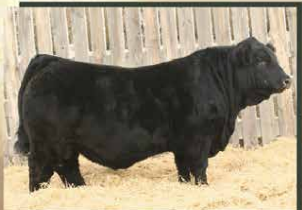
born March 17

Homozygous Polled Non Dilutor, out of two black parents