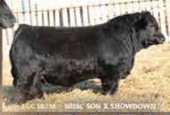
EGC 180M 905C SON X SHOWDOWNS