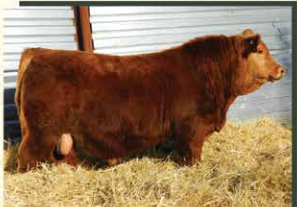
LTS BELIEVE 4051M